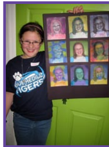
Student shows Warhol inspired portrait from last semester's "Avante Garde Art" class.

To stay informed about new classes and events, send us your e-mail address! info@newarkartsalliance.org "Like us" on Facebook too!