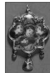
The Song Phoebe Anna Traquair