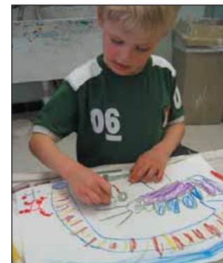
Whew! This summer's classes for kids will go on as planned.

• Exhibits. The Fourth Annual Members Show is currently on display. Next is “Animania,” an open juried show of artwork with an animal theme. The drop-off date is Sun., July 8, from 12-4 p.m. The opening reception on Fri., July 13 is from 7-9 p.m.